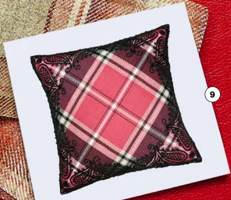
1. Galiot blue plaid cotton duvet cover by Eastern Accents, $513. perigold.com 2. Grassmarket Check in red, $144 per yd. thibautdesign.com 3. Calais Plaid in Peacock. fabricut.com 4. Langtry in Caramel/Burgundy by Sanderson. zoffany.com 5. Patterned Lucite tray in White Tartan plaid, $115. markandgraham.com 6. Bristol Plaid in Tuscan. scalamandre.com 7. Ireland 4 Slate by Stout, $61 per yd. estout.com 8. Nevis Plaid in Tomato, Green by Colefax and Fowler. cowtan.com 9. Hand-embroidered Branca Tartan pillow, $525. casabranca.com