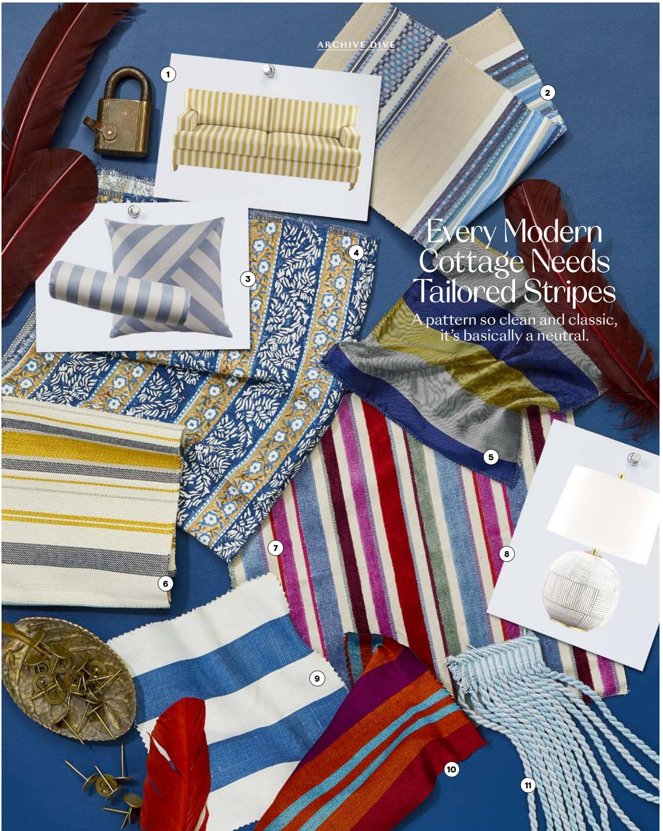
1. Classic sofa in Citrine Cabana Stripe, $2,190. theinside.com 2. Cyrus Cotton Stripe in Chambray. scalamandre.com 3. Halo indoor/outdoor pillows in Chambray T-Stripe by Wendy Jane Performance Pillows, $147 to $214. gabbyhome.com 4. Otto Blue. tulutextiles.com 5. Herat. clarelouisefrosts.com 6. Dobby Stripe in Dijon by Sanderson. zoffany.com 7. Hema in Cardinal by Manuel Canovas. cowtan.com 8. Laurel table lamp, $590. hudsonvalleylighting.hvlgroup.com 9. French Stripe in blue, $150 per yd. bassetmtnab.com 10. Kabul. clarelouisefrosts.com 11. Loire bullion fringe in Wedgewood. samuelandsons.com

A pattern so clean and classic, it's basically a neutral.