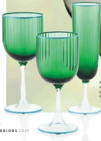
Aquazzura striped glassware, aquazzura.com