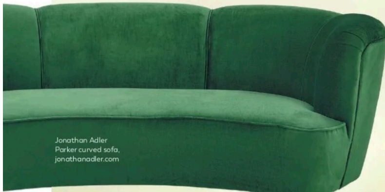
Jonathan Adler Parker curved sofa, jonathanadler.com