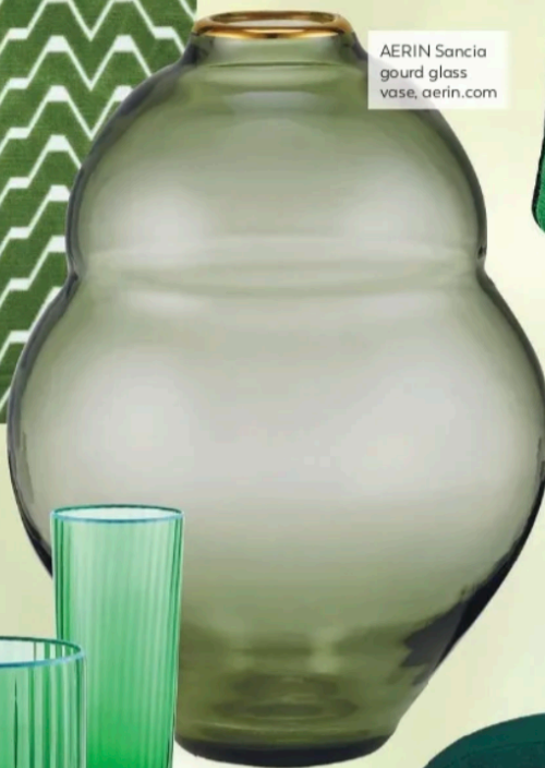
AERIN Sancia gourd glass vase, aerin.com