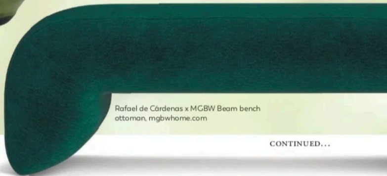
Rafael de Cárdenas x MCBW Beam bench ottoman, mgbwhome.com

BACKGROUND PHOTO BY ARTIST CHANARONG PRASERTTHAISIT TOOK PRODUCT PHOTOS COURTESY OF BRANDS