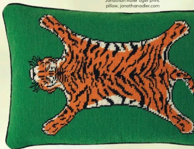
Jonathan Adler tiger print pillow, jonathanadler.com